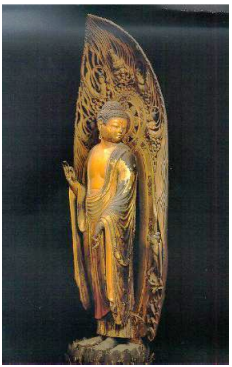
Mikaeri Amida Nyorai: "Tathagatha Amida [Buddha] Looking Back." Emphasizing Amida Buddha's infinite compassion, this National Treasure from Zenrinji Temple in Kyoto shows Amida Buddha looking back for any stragglers to bring to the Pure Land.