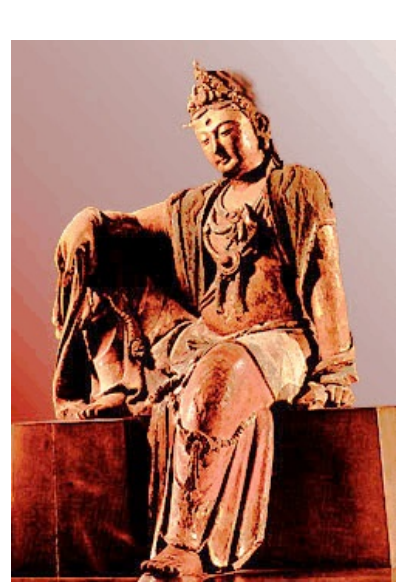
The Bodhisattva Guanyin (Avalokitesvara), in the position of "royal ease."