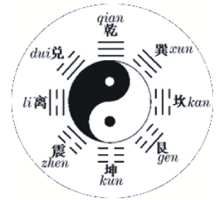
The 8 Trigrams and the Taiji symbol

N Sources , pp. 206-212 (Li Si), 235-242 ( Lüshi chunqiu , Huang-Lao Daoism), 273-282 (medical theory, the six schools), 292-297 (Dong Zhongshu), 311-325 (Confucian canon, Yijing ), 344-352 (three bonds, cosmology, time)