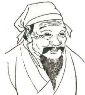
朱熹 Zhu Xi

Read: N CRT , 91-97 N Sources , pp. 568-573, 583-585 (Han Yu), 587-590 (Song revival), 667-678 (Zhou Dunyi), 682-684 (Zhang Zai), 689-695 (Cheng brothers), 697-705 (Zhu Xi)