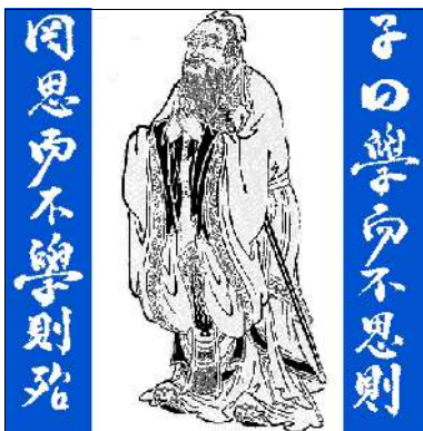
"The Master said, 'Learning without thinking is in vain; thinking without learning is dangerous.'"