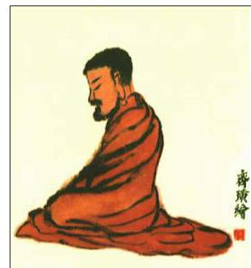
Bodhidharma (Damo) in meditation.