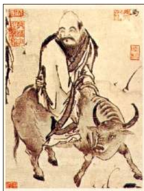
Laozi departing through the Western Pass.