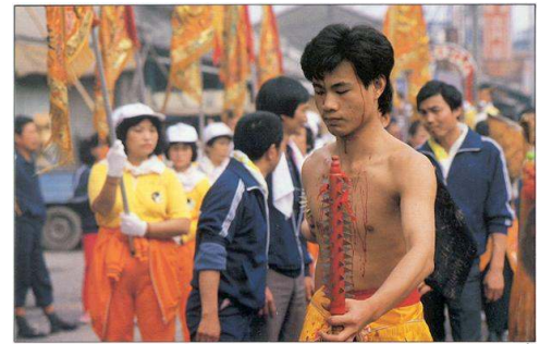
A dangki (spirit-medium or shaman) flailing himself during a temple festival in Taiwan.

N "Lord Kuan Manifests a Divine Presence..." (from Luo Guanzhong, Three Kingdoms ) [ Moodle ]